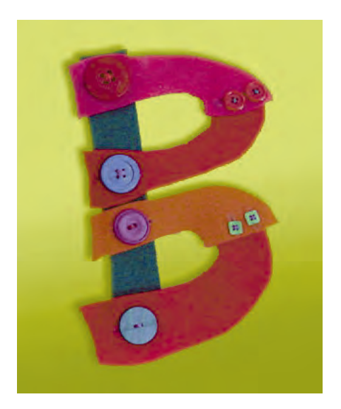
B - various colors of felt, buttons, needle and thread, scissors