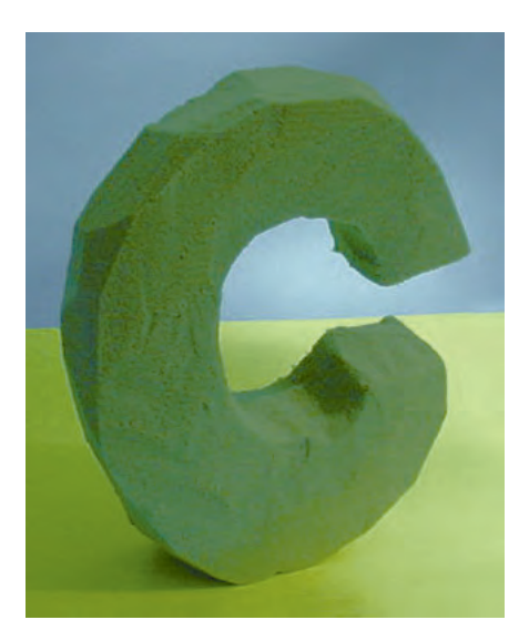
C- dry florist foam block, serrated dinner knife