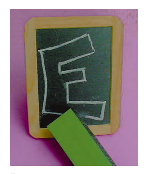
E - slate board or black poster board, chalk, eraser