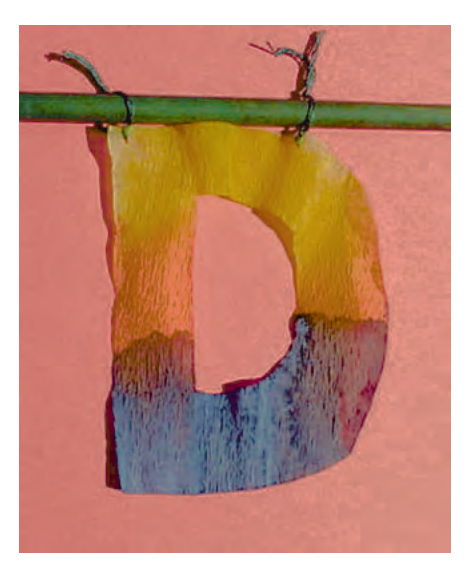
D- red, blue, and yellow food coloring, containers for food coloring (prepare according to directions for egg coloring but boost the amount of color), D cut from crepe paper or copy paper, scissors, needle, thread, and stick. (Last three items are optional)