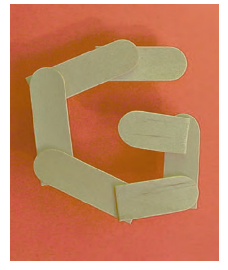
G - wood craft sticks, garden pruners to cut sticks, glue